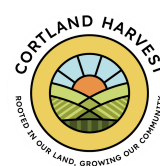
3" or 4" Sticker, 5" window cling